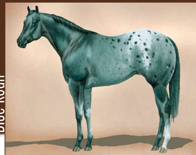
Description: White with spots over body and hips Face Markings: None Leg Markings: left hind partial stocking