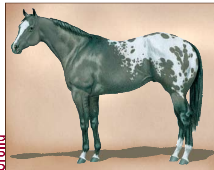
Description: White with spots over back and hips Face Markings: Star, stripe and snip Leg Markings: Left front pastern, left hind ankle, right front half-pastern, right hind half-stocking