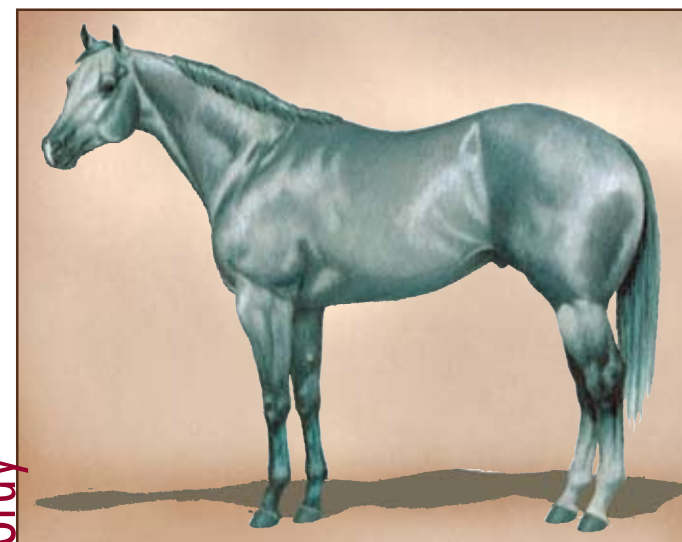
Description: Solid Face Markings: Star, snip Leg Markings: None