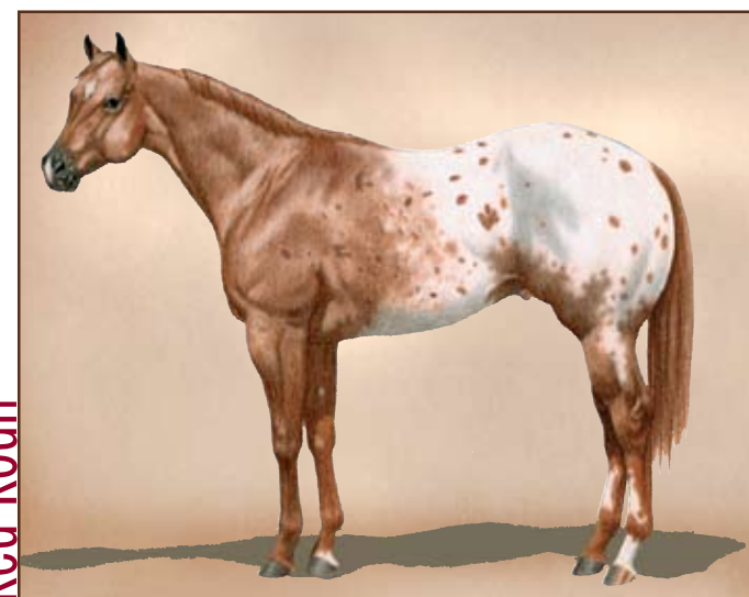
Description: White with spots over back and hips Face Markings: Star and snip Leg Markings: Left hind pastern, right front partial half-pastern, right hind lightning marks