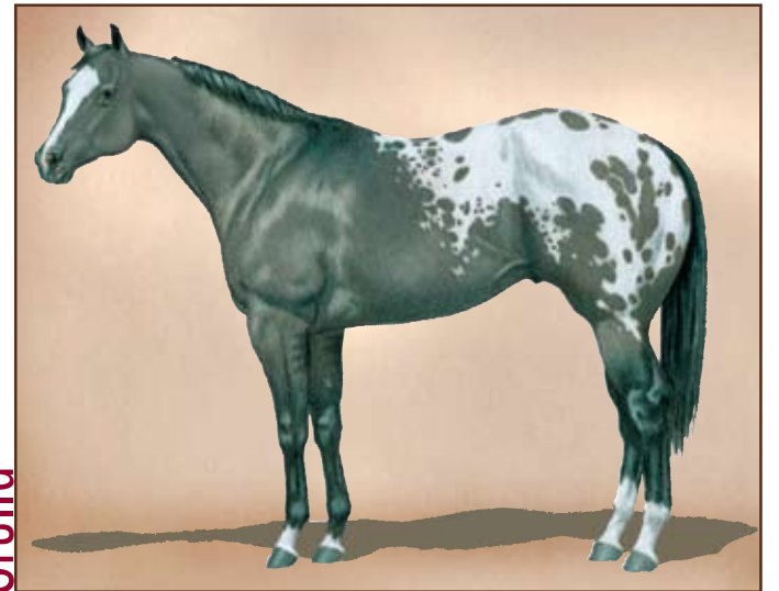
Description: White with spots over back and hips Face Markings: Star, stripe and snip Leg Markings: Left front pastern, left hind ankle, right front half-pastern, right hind half-stocking