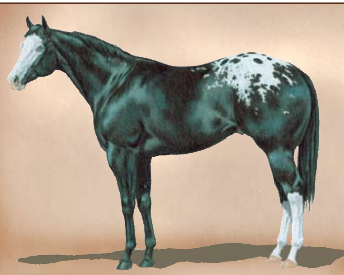
Description: White with spots over loin and hips. Both eyes blue Face Markings: Bald face, snip lower lip Leg Markings: Left hind stocking, right hind stocking