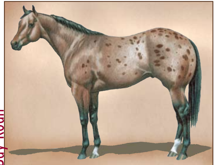
Description: Spots over body and hips Face Markings: None Leg Markings: Right front pastern, right hind ankle