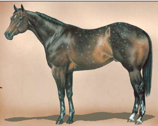
Description: Roan over body and hips Face Markings: Star Leg Markings: Left front lightning marks, left hind partial pastern, right front lightning marks, right hind partial pastern