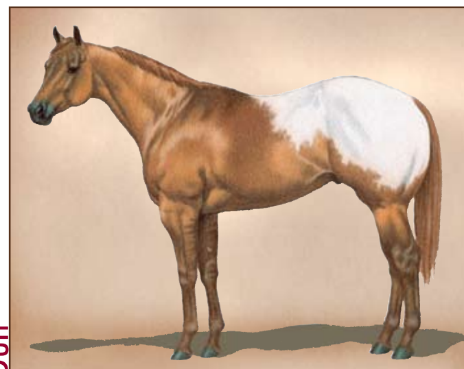
Description: White over back and hips Face Markings: None Leg Markings: None