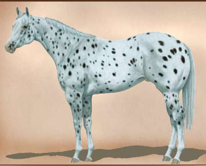
Description: White with spots over entire body Face Markings: None Leg Markings: None