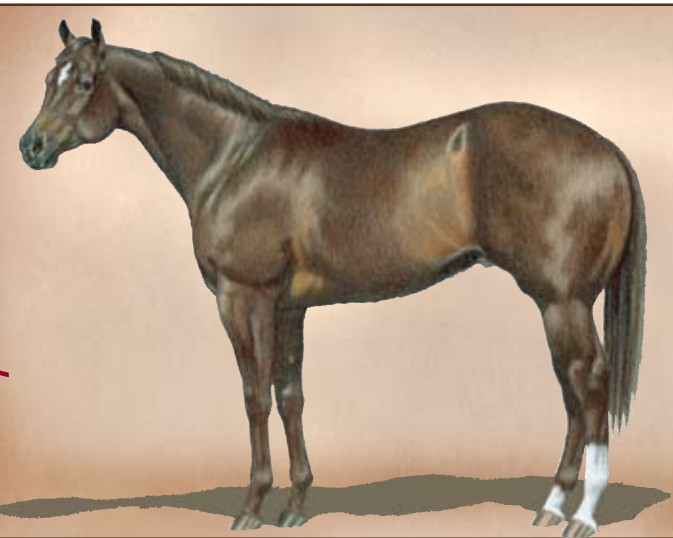
Description: Solid Face Markings: Star Leg Markings: Left hind half-stocking, right hind pastern