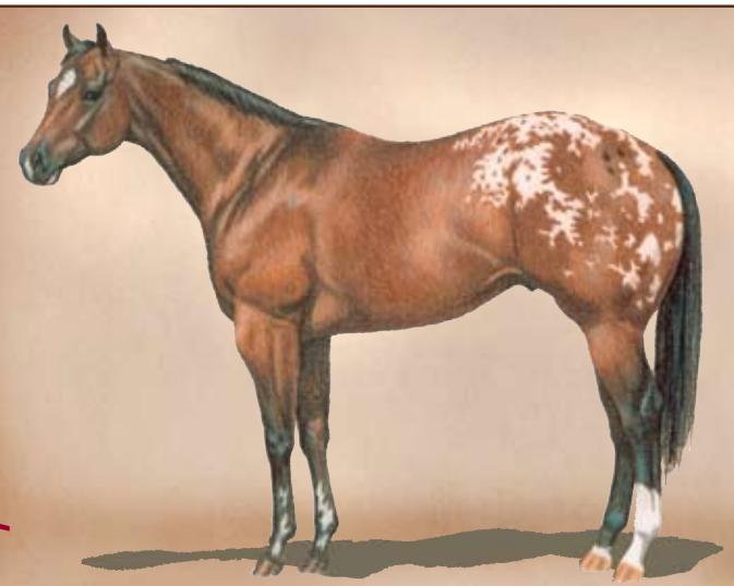
Description: White with spots over loin and hips Face Markings: Star, snip, snip lower lip Leg Markings: Left front lightning marks, left hind half-stocking, right front lightning marks, right hind half-pastern