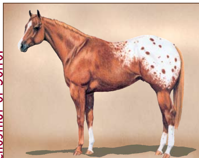
Description: White with spots over back and hips Face Markings: Star, stripe and snip Leg Markings: Left hind stocking, right front stocking, right hind partial half-stocking