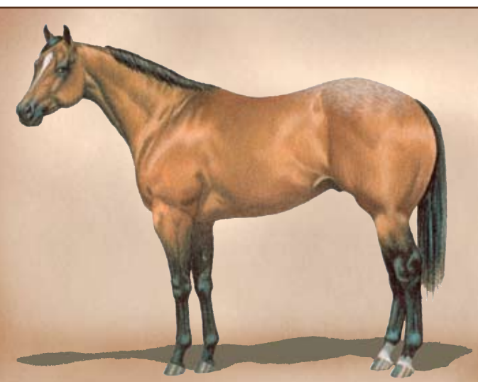
Description: Roan over loin and hips Face Markings: Star and stripe Leg Markings: Left hind half-pastern, right hind pastern

The Appaloosa has a bold and colorful heritage, originating some 20,000 years ago. Its appearance and unique qualities earned it special recognition in the drawings of cave dwellers, worship in ancient Asia, and status as a prized mount of Spanish explorers, Native Americans and western settlers. Today, the Appaloosa's color, versatility, willing temperament and athletic ability make it a popular choice for a number of activities.