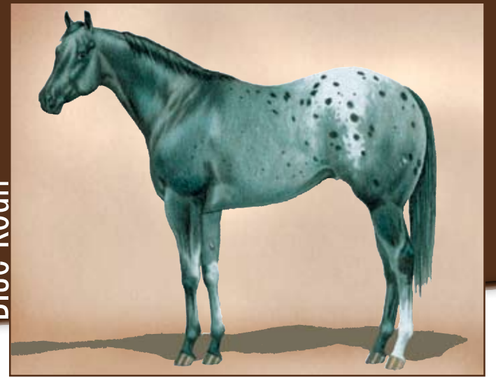
Description: White with spots over body and hips Face Markings: None Leg Markings: left hind partial stocking