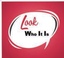
Cheryl Ogle Moscow, TN