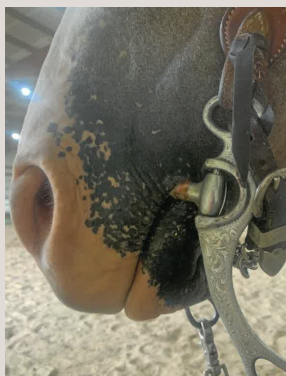
Owen Colegrove 13 & Under (Right)