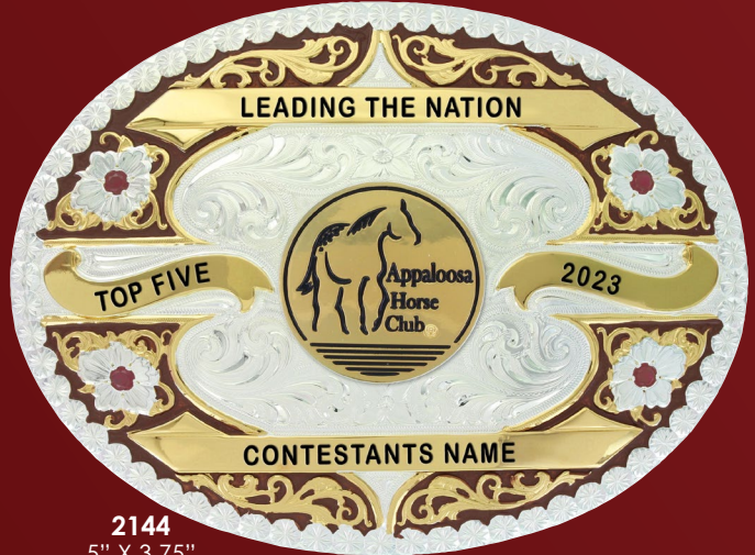
2144 5" X 3.75" ApHC Price: $280

These exclusive buckles are individually die-struck and crafted by master engravers. Each buckle will be beautifully finished in gold and silver electroplate and black enamel personalization on the ribbons.