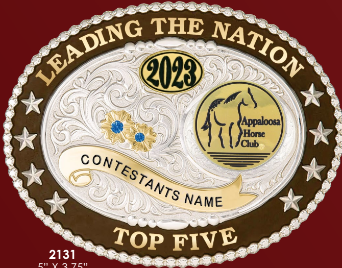
2131 5" X 3.75" ApHC Price: $360

ORDERS RECEIVED AND PAID FOR BY THE 10TH OF EACH MONTH WILL BE PLACED BY THE END OF THAT MONTH. ORDERS RECEIVED AFTER THE 10TH OF EACH MONTH WILL BE PLACED THE FOLLOWING MONTH.